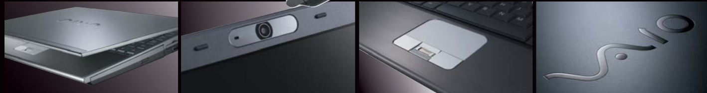
■ Ultra-slim display ■ MOTION EYE camera centred on a thin LCD bezel ■ Built-in Fingerprint Sensor ■ Black VAIO hairline logo