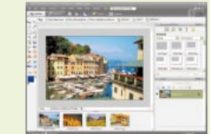
Adobe Photoshop Elements